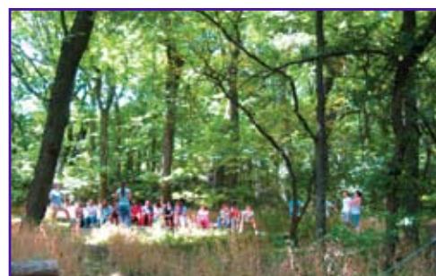
Leadership group in the woods

STARS is an acronym for S trength, T eamwork, A ttitude, R elationships, and S elf-esteem. STARS Camp provides an opportunity for children and adolescents with SED to develop self-esteem, interpersonal skills, and to discover personal strengths