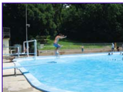
Pool and ponies are favorite activities of the campers