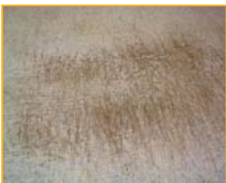
TILE FLOOR BEFORE