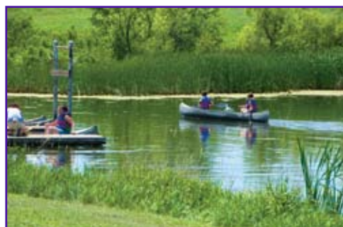
Fun in the sun—for canoeists

A donation from the Manhattan Breakfast Optimist Club helped in the purchase of camp t-shirts.