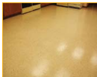
TILE FLOOR AFTER